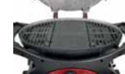
Reversible centre hotplate TR