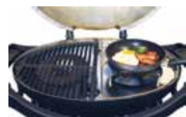
Trivet kit TW