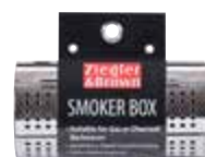
Smoker Box PO TW TR