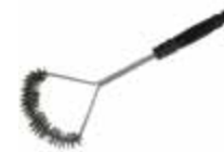
Easy reach cleaning brush PO TW TR