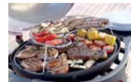
Grill warming rack TW