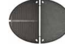
Reversible hotplate TW