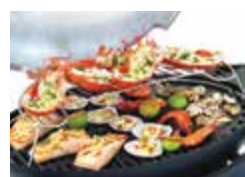
Grill warming rack TR