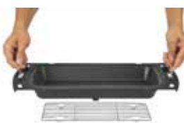
Baking Dish TR