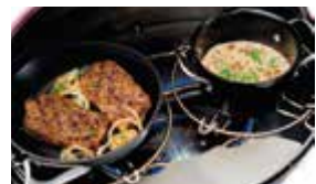
Trivet kit PO