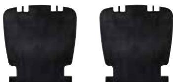
Side shelves PO