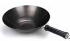
Durable carbon steel, 31 cm, non-stick wok PO TW TR