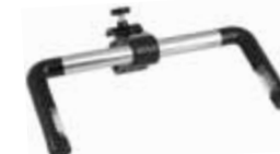
Handle mount bbq light PO TW TR