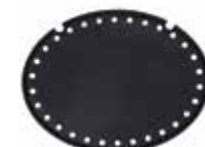
Full cast iron hotplate PO