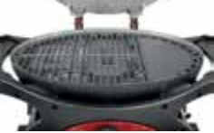
Reversible side hotplate TR