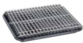
Bake & roast pack - includes deflector tray, baking rack & roasting tray PO TW TR