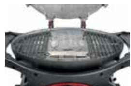
Trivet kit TR