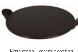
Pizza stone - ceramic coating, side handles, available in 30 cm or 38 cm PO TW TR