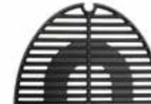
Half Grill PO