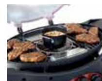
Reversible Trivet TR