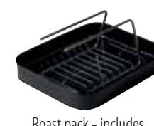
Roast pack - includes drip tray, roasting rack and roasting tray PO TW TR